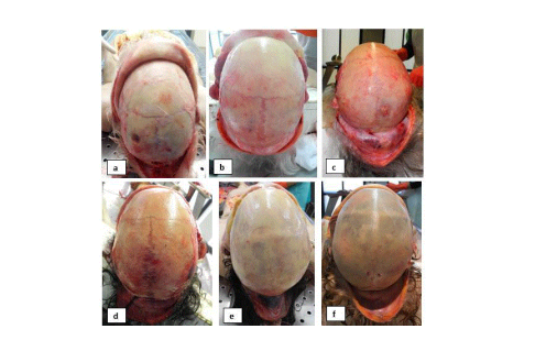
Figure 1: a) 86 years old, b) 75 years old, c) 66 years old, d) 26 years old male, e) 30 years old female, f) 36 years old female.

A sample of 100 neurocranium was photographed during autopsy. The sex and age of each subject was recorded, and each suture was analyzed using the Meindl and Lovejoy method. A score between 0 and 3 is assigned to each suture depending on the level of obliteration: completely opened suture (0), less than 50% obliteration (1), more than 50% obliteration (2), or complete obliteration (3). Only the coronal, sagittal, and bregma sutures were considered. These sutures are easily observed during autoptical examination. A summary score was calculated and the authors examined this score's association with the age at death (Figure 1).