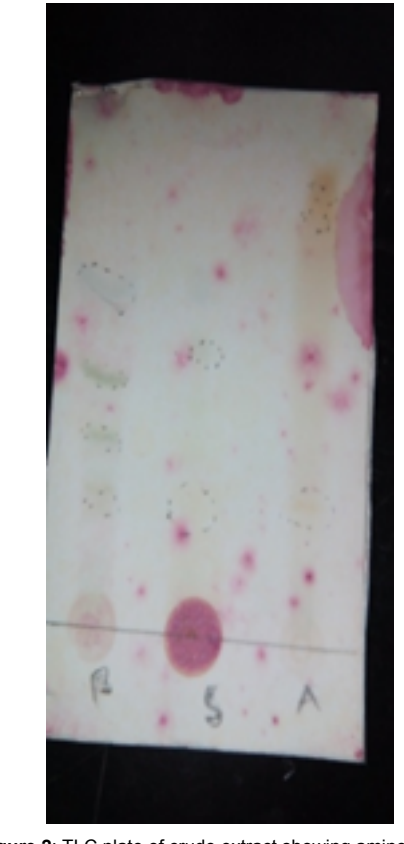
Figure 2: TLC plate of crude extract showing amino acids.