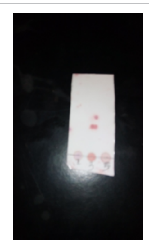
Figure 3: TLC plate of the crude extract showing peptides.