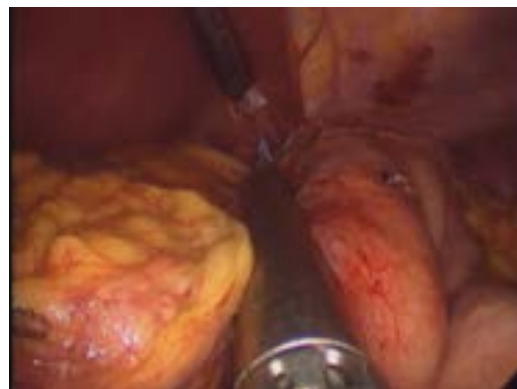
Figure 3: Stapling stomach around bougie.