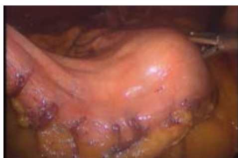
Figure 2: Insertion of 38 fr bougie.