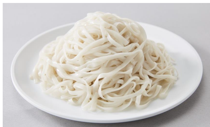
Figure 1: Low-sugar and high-dietary fiber noodles, Kibun Healthy Noodle™.

Healthy adult men, aged 22 to 35 years, with a body mass index of 18.1 to 23.9 kg/m 2 , were recruited from the capital area, including Tokyo, Japan (Table 1). The exclusion criteria were (I) any type of physical and mental chronic diseases including type 1 or type 2 diabetes; (II) positive for syphilis, HIV virus, hepatitis B virus, and hepatitis C virus; (III) regular use of supplements/medications that might interfere with the levels of blood glucose and insulin; (IV) allergy to wheat, soybean, and others; and (V) unwillingness to follow the study protocol. The experiments were performed at Kitasato University, Kitasato Institute Hospital. The experimental protocol was approved by the Human Experiment Ethics Committee of the laboratory, and this clinical trial was registered with the UMIN Clinical Trial Registry (no. UMIN000023986). All participants provided written informed consent. Of the twelve eligible men, eight were enrolled in this study.