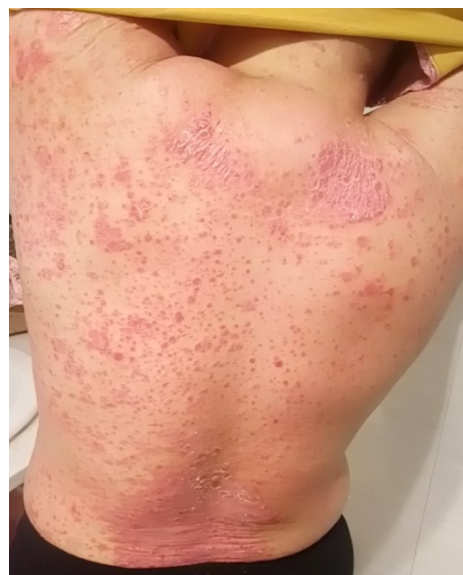
Figure 4: Second round of extensive eruption.

Since the second time had no any aggravating factors, it was somehow indicating that it was not a case of drug eruption and we were more inclined towards psoriasis induced upon the administration of G-CSF 4 months ago the initial drug eruption being the early psoriatic presentation.