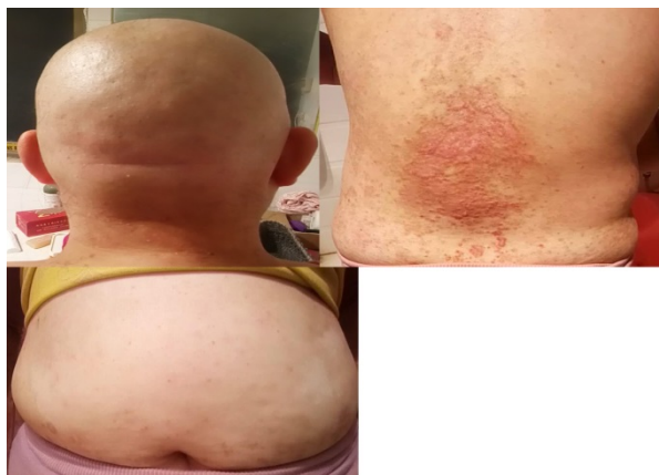
Figure 2: Complete remission of lesions over the scalp and abdomen. Residual maculopapular rashes and island of patches over the back after 2 months during follow up.