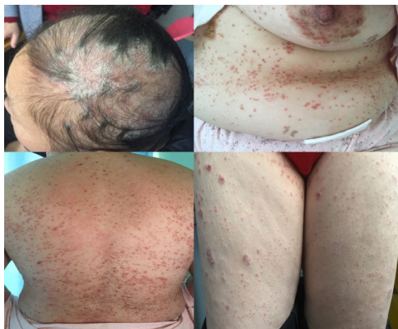
Figure 1: Erythematous maculopapular rashes and patches with silvery white scales over the scalp, abdomen, back, and thighs at presentation.

the large erythematous maculopapular rashes without scales. Therefore, the patient was under simultaneous treatment for her cancer and the drug eruption. But again after 4 months of initial eruption, she had a second round of sudden extensive eruption all over her body. The lesions were small red maculopapular rashes to large scaly patches similar to the first episode of the eruption. The patient however refused to do another biopsy and insisted on supportive management (Figure 4).