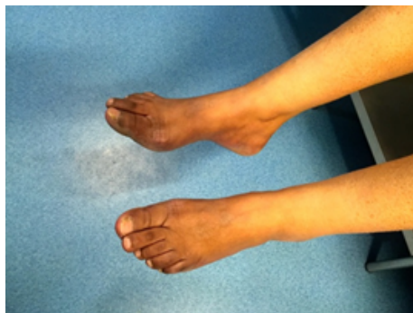
Figure 1: Feet hyperpigmentation.

A 33-year-old woman presented with anal squamous cell carcinoma staged T2N1M0, she underwent radiation therapy with concomitant Capecitabine administered orally at a dose of 825 mg/m 2 twice a day throughout the course of radiation. Three weeks after initiation of treatment she presented with hyperpigmentation involving the dorsum and the bottom of both hands and feet, with reinforcement over the knuckles and toes (Figures 1,2).