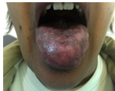
Figure 3: Hyperpigmentation of the dorsum of the tongue.

Careful examination of the palms showed erythema underlying the hyperpigmentation. We retained the diagnosis of palmar-plantar erythrodysesthesia (the hand-foot syndrome). The peculiar case of this patient is the involvement of the dorsum of the tongue with patchy and confluent hyperpigmentation without ulceration (Figures 3,4).