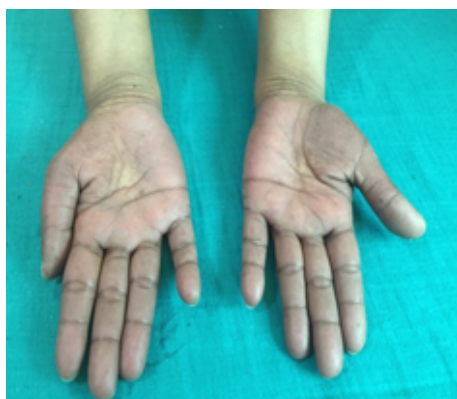
Figure 2: Hyperpigmentation and erythema of both hands.

Careful examination of the palms showed erythema underlying the hyperpigmentation. We retained the diagnosis of palmar-plantar erythrodysesthesia (the hand-foot syndrome). The peculiar case of this patient is the involvement of the dorsum of the tongue with patchy and confluent hyperpigmentation without ulceration (Figures 3,4).