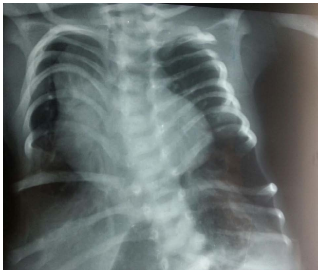
Figure 2: Chest radiograph showing only nine ribs, widening of inter costal spaces, vertebral malformations type of hemivertebrae floor of the dorsal scoliosis.

scalp, a protruding abdomen, rib anomalies (irregular size and shape) and vertebral malformations especially hemivertebrae, realizing a puzzle form sit above the thoracolumbar floor and often associated with scoliosis [1,4,5]. Other skeletal anomalies may be observed: winged scapula, malformation of the odontoid process, lack of atlas, irregular clavicle, hypoplasia of the humerus, extended iliac wings [2-5].