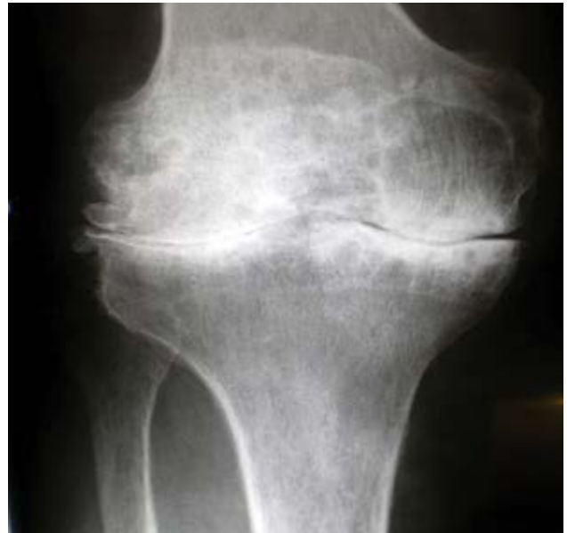
Figure 2a: X-ray of the right knee.

When retesting requirements postoperatively the idea of further clarification of the unusual findings towards ochronosis comes on. A determination of homogentisic in urine is not performed preoperatively.