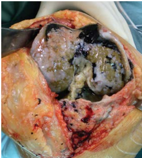
Figure 2b: Intraoperative findings of the right knee.

In arthritis, rapidly progressive disorders of the spine or peripheral joints, wherein the rheumatologic diagnosis (ANA, anti-CCP, HLA-B27, eg) can deliver no suitable values, an accumulation disease should be assumed as a cause and excluded. In diagnosis of ochronosis the level of alcapton in blood and urine together with the pathognomonic urine is conclusive for the disease. If these values seem unremarkable, provides only the exact and also repeated history indications of an exogenous cause, or exposure of the person concerned.