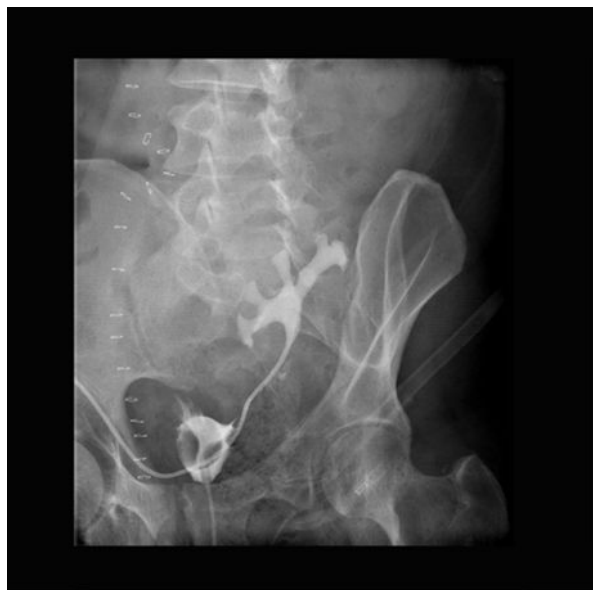
Figure 2: Antegrade depiction over MJ-stent 7th postoperative day after autotransplantation with Boari plastic surgery.

The characteristics of the patient group are shown in (Table 1).