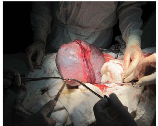
Figure 3: Intraoperative image. The tumor was isolated and had to be drained (4L of liquid were extracted) before it could be removed.

various degrees of acidophilia. This suggests a highly increased rate of division which is specific for borderline tumors (Figure 5).