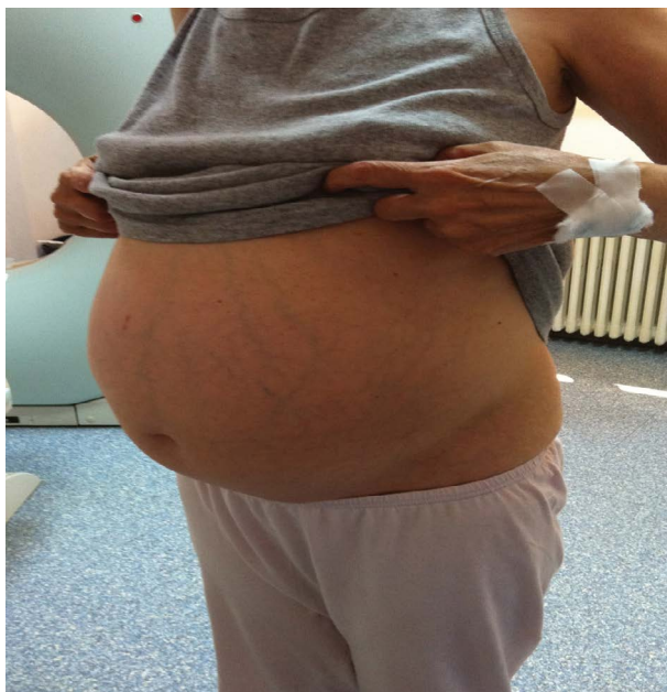
Figure 1: The patient first presented to the hospital with an enlarged abdomen and visible collateral venous circulation.

The histological examination revealed a multilocular mucinous cystadenoma with borderline areas and necrosis. The left salpinx had thickened mucus creases. Towards the internal layer of the cyst there are papillary proliferations and ramifications. You can also observe unistratified and pluristratified layers of cylindrical and cubic cells of different sizes along with areas that appear to be squamous metaplasia. In our samples we can see intensely basophilic nuclei and cytoplasm with