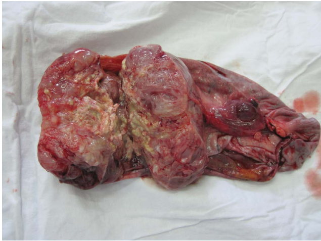
Figure 4: Tumoral formation originating from the left ovary.