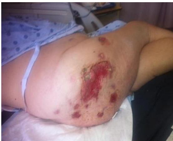
Figure 2: Post debridement with granulation occurring.