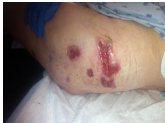
Figure 1: Initial lesions with extensive necrosis over the thighs and buttocks bilaterally.

She was admitted to hospital for the management of acute exacerbation of chronic kidney disease before her angioplasty. On admission, the patient was alert and oriented. She was on warfarin approximately for the past 11 years for AF, which was stopped before the procedure and was resumed afterward. The patient did not receive heparin at the time of re-initiation of warfarin. Over the next few days, the patient developed several skin lesions over the thighs and gluteal areas bilaterally which initially presented as large, bullous and hemorrhagic areas (Figure 1). A few hours later, primary lesions progressed to necrotic plaques (Figures 2 and 3).