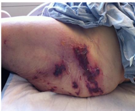
Figure 3: Healing lesion.

Calciphylaxis was considered the initial diagnosis because of elevated parathyroid hormone (PTH) levels and also with regards to her concurrent CKD and hemodialysis therapy. Later, an incisional skin biopsy was performed, and the pathology showed extensive cutaneous necrosis with associated neutrophilic inflammation, without smooth muscle calcification consistent with the clinical impression of WISN (Figures 4 and 5). Also, improvement of lesions while holding warfarin and timing and evolution of lesions after restarting warfarin were further clues for diagnosing warfarin-induced skin necrosis (WISN).