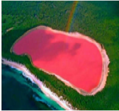
Figure 3: Lake Hiller Western.

(Samantha Joye expeditions), deep ocean sites of Western Greenland (Diana Krawczyk, Greenland) (Figure 3), Alaskan permafrost, acidic brine ponds (Sarah Johnson), and a range of sample types from Antarctica (Joye and Mikucki). Extreme animal microbiomes include feces of penguin and hummingbird.