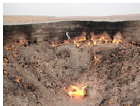
Figure 2: "Door to Hell" Gas Crater.

The MGRG has also initiated a novel microbiome project to characterize organisms from extreme environments by deploying three whole-genome shotgun sequencing platforms: Illumina HiSeq (2x250), MiSeq (2x300), and Ion Torrent PGM (400bp). Amplicon and targeted sequencing, such as for 16S ribosomal RNA, will not be included in these studies.