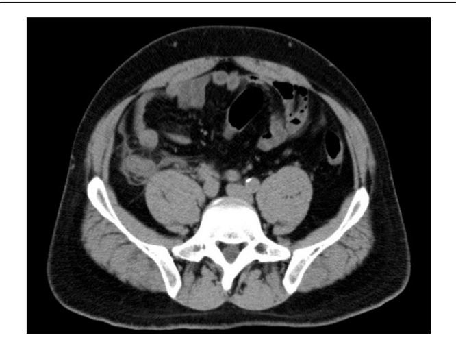
Figure 1: A Computed Tomography (CT) scan demonstrated a swelling of the appendix with elevated concentration of surrounding fat.

A 40-year-old male was referred to Omori Red Cross hospital because of abdominal pain for several hours. His Body Mass Index (BMI) was 27.5 kg/m<sup>2</sup> (165 cm, 75 kg). The pain localized in the right lower quadrant and there was diaphoresis and mandible thrill on arrival. Physical examination revealed tenderness on pressure in the right lower quadrant, but there was no muscular rigidity. He had a low grade fever of 37.3°C,100 beats/min, and 168/123 blood pressure. He had suffered from hypertension and gastroesophageal reflux disease, but he had no history of neuromuscular disease and surgical operations. Also, he had no significant family history. He had been a heavy drinker and a smoker. Hematological examination revealed white blood cells 13500/mm<sup>3</sup>, Glutamate Oxaloacetate Transaminase (GOT) 55 IU/L, Glutamate Pyruvate Transaminase (GPT) 69 IU/L, and \gamma -glutamyl transpeptidase ( \gamma -GTP) 449 IU/L. Other laboratory results were in normal range. A Computed Tomography (CT) scan demonstrated a