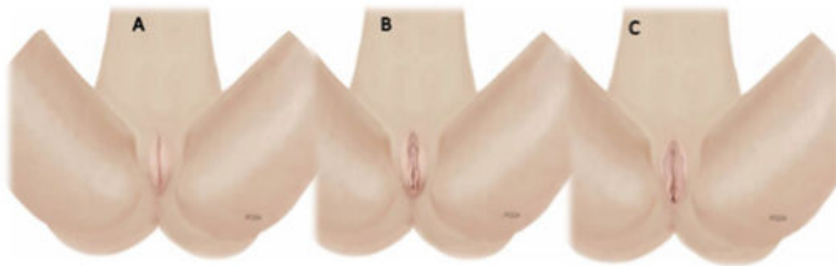
Figure 1: The options depicted the labia major with non-visible labia minora (A), with barely visible labia minora, protruding only to the distal edge of the labia major (B) and with protrusion of the labia minora beyond the labia major (C). All three depict normal variants of labia minora.

The last two survey questions asked respondents to consider three graphically designed images of vulvae, which varied only in labia minora protrusion (Figure 1).