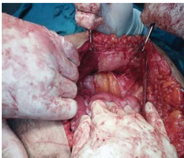
Figure 1: Separation of rectus muscle from the peritoneum.