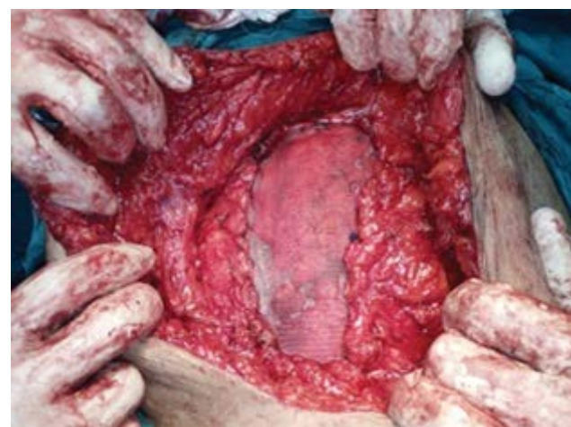
Figure 3: The prolene mesh was fixed by continuous sutures all around.