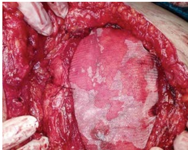
Figure 2: Prolene mesh was fixed by 4 stitches.

The predisposing factors were obesity, multiparity, chronic cough were found in 15 patients. The mean operative time was 47.5