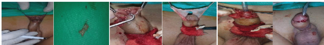
Figure 2: Illustrate the steps of the technique, upper right graft marking, middle graft harvested, left, graft in place, below right dartos flap dissected, middle, after tabularization left end result of the technique.