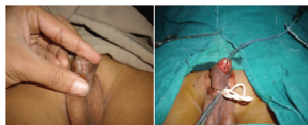
Figure 1: Pre, and intra-operative picture of the technique (distal penile hypospadias).

The surgical procedure is performed with the patient under general anesthesia or caudal block one. The graft was harvested from the inner aspect of the prepuce (Figure1).