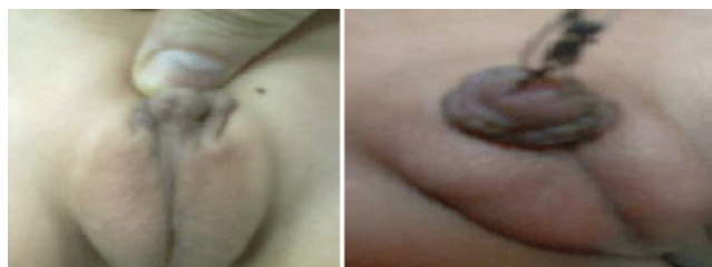
Figure 3: Preoperative and before catheter removal

The following complications occurred in 20 patients (8.8%): fistula formation in 6 (2.6%), wound infections in 14 (6.2%), and no meatal stenosis in any of the cases. There were no cases of hematoma or other complications. The patients with wound infections were treated conservatively with complete healing within one week, except for 3 of them who develop fistula and included in the fistula complications. The mean time for catheter application were 8 days ranging from 7-12 days (Figures 3 and 4).