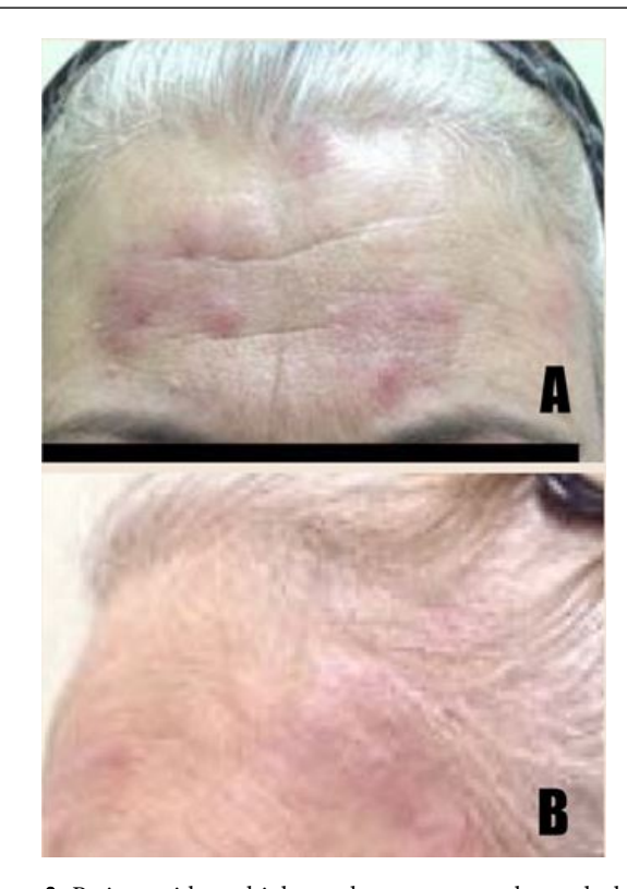
Figure 3: Patient with multiple erythematous papules and plaques on the forehead, sides of the face and the cheeks treated with intralesional rituximab (10 mg/lesion) per week for 18 weeks.

The patient was treated with intralesional rituximab (10 mg/lesion) per week for 18 weeks. Rituximab infusion induced side effects such as severe pain during injection, dizziness, headache, lethargy, limb pain, and nausea, which decreased after oral antihistamine treatment (Figure 3B). However, the patient showed recurrence of the papules and plaques after 1 month.