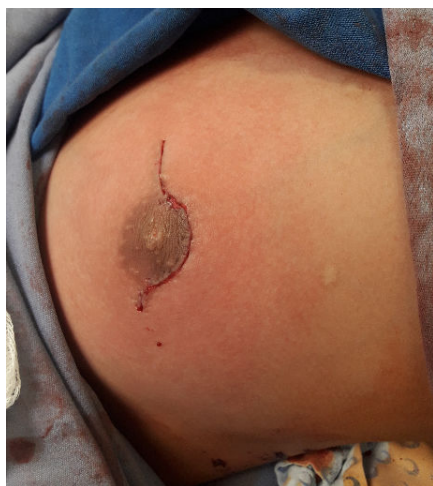
Figure 6: Right breast at the end of surgery, the four quadrants with hyperemia are observed.