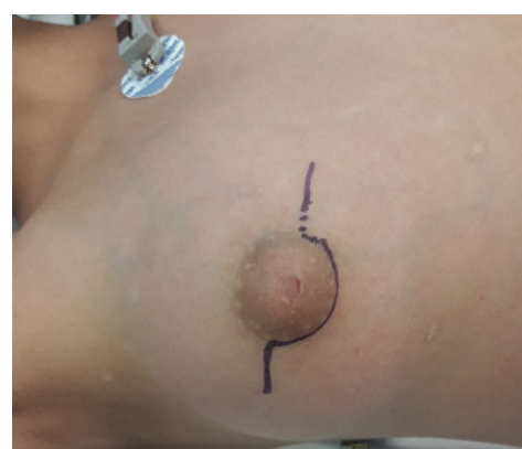
Figure 4: Right breast with La tumor of approximately 10 \times 9 \times 5 cm, with defined edges, mobile, painful on palpation, a collateral venous network which reaches the infraclavicular region, surgical marking was done on the right Breast.

An assessment is requested by the pediatric oncological surgery service deciding surgical management urgently-right breast lumpectomy. In the operating room under general anesthesia, dorsal decubitus position (Figure 4) asepsis of the thorax and abdomen, sterile fields are placed, a peri-areolar incision with an omega-shaped extension is made, it is incised by subcutaneous planes, finding a tumor-independent mammary gland. The tumor was resected manually and with electrocautery, complete resection of the tumor was performed, which average approximately 10 \times 9 \times 5 cm (Figure 5), hemostasis is verified, surgical wound is closed by subcutaneous planes with long absorbable suture material. Duration 3 zeros with simple points, skin monocryl 4 zeros submerged without incident (Figure 6). The compressive bandage is placed, and it is discharged the following postoperative day, attending a medical consultation at 4 weeks with adequate postoperative evolution, with a report of pathology reporting phyllodes tumor, ultrasonographic control was requested and it was reviewed in the sixth month without evidence of tumor.