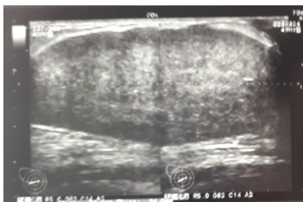
Figure 2: Phyllodes tumor, a discrete lobulated tumor of 83 \times 80 \times 53 mm in diameter, hypoechoic, discretely heterogeneous with bright punctate images suggestive of microcalcifications, an axillary region with ovoid hypoechoic ganglia of 4-7 mm in diameter with echogenic hilum, echographically benign appearance without observing left axillary nodes.