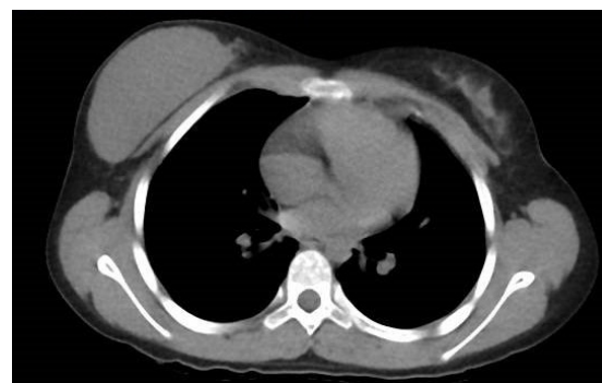
Figure 3: Simple chest tomography in which homogenous tumor is observed in right breast of approximately 95 \times 60 mm with rounded edges which do not invade the pectoralis major muscle, left breast without evident alterations, without evidence of tumor activity in the lungs.

An assessment is requested by the pediatric oncological surgery service deciding surgical management urgently-right breast lumpectomy. In the operating room under general anesthesia, dorsal decubitus position (Figure 4) asepsis of the thorax and abdomen, sterile fields are placed, a peri-areolar incision with an omega-shaped extension is made, it is incised by subcutaneous planes, finding a tumor-independent mammary gland. The tumor was resected manually and with electrocautery, complete resection of the tumor was performed, which average approximately 10 \times 9 \times 5 cm (Figure 5), hemostasis is verified, surgical wound is closed by subcutaneous planes with long absorbable suture material. Duration 3 zeros with simple points, skin monocryl 4 zeros submerged without incident (Figure 6). The compressive bandage is placed, and it is discharged the following postoperative day, attending a medical consultation at 4 weeks with adequate postoperative evolution, with a report of pathology reporting phyllodes tumor, ultrasonographic control was requested and it was reviewed in the sixth month without evidence of tumor.