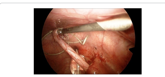
Figure 4a: Isolation of the ureter with the help of "spaghetti technique" (the ureter is rolled around the grasper during the isolation).