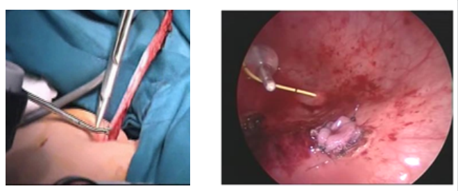
a Extravesical transurethral tailoring of the ureter