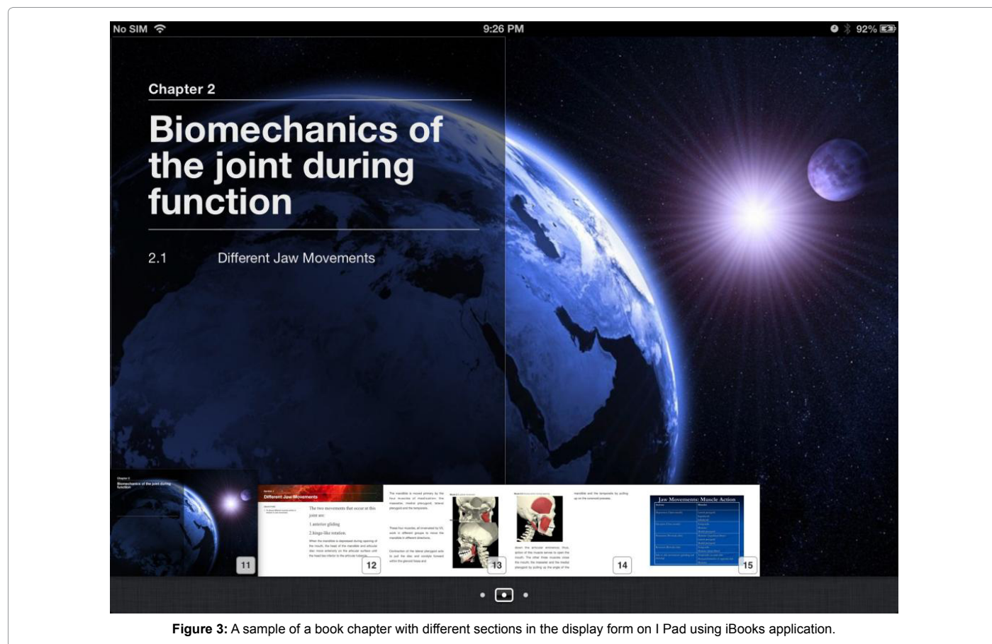
Figure 3: A sample of a book chapter with different sections in the display form on I Pad using iBooks application.