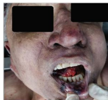
Figure 1: Photograph of the face of the deceased showing the mucosal surface of lower lip by everting the lip.

of labial area, a bluish contusion over inner aspect of corner of mouth right side extending inwards measuring 2 × 0.5 cm. A bluish contusion over inner aspect of lower lip in the midline measuring 4 × 3 cm (Figure 1). A bluish contusion over inner aspect of corner of mouth left side extending inwards measuring 1.8 × 0.4 cm. A bluish contusion over the right and left lateral aspect of tongue measuring 1 × 1 cm and 1.2 × 0.8 cm respectively. The fingernails of both hands were bluish in color and all organs were congested. The external injuries were so minimal that it escaped from the eyes of the emergency medicine doctors.