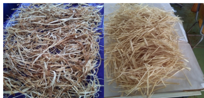
Figure 2: Photo of samples root bark and root wood of A. schimperiana

The root of A. schimperiana was collected from east wollega zone, Nekemte town, in May 2018 and the plant was identified by Dr Tena Regasa, a botanist from Wollega University, Biology department. The collected plant root was washed with distilled water to remove dirt or unwanted materials. The cleaned root part was peeled so that the root wood and root bark were dried separately (Figure 2) under shade at room temperature and ground in to powder using analytical mill. The powdered root parts were subjected to solvent extraction using maceration technique.