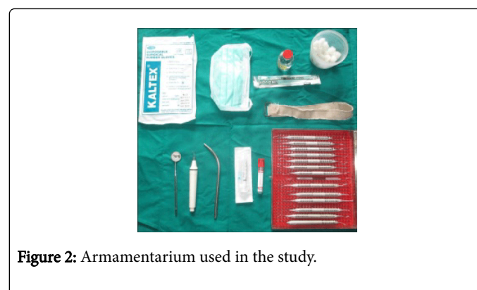
Figure 2: Armamentarium used in the study.