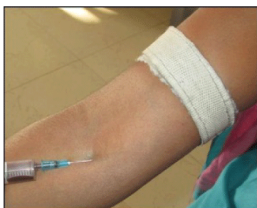
Figure 3a: Venous blood collection from antecubital fossa.