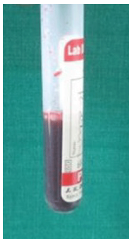
Figure 3b: Collected venous blood in the plain vial.

Under aseptic precautions, 2-3 ml venous blood was collected from subjects by a single venepuncture in the antecubital fossa in plain vials, at baseline and 1 month after non-surgical periodontal therapy in aggressive and chronic periodontitis whereas only at baseline in non-periodontitis group, which was sent for laboratory analysis. All biosafety measures were followed.