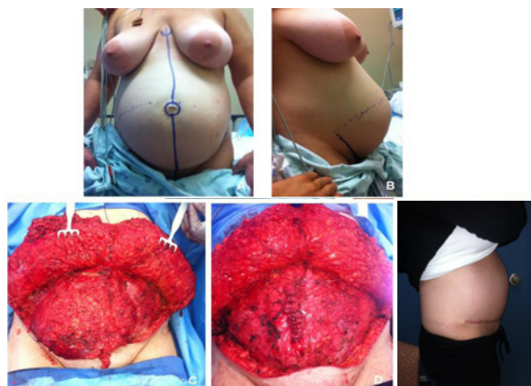
Figure 5: Case of a 36 years old female a year after postpartum with development of rectus diastasis. A and B. Anterior and lateral views. C. Exposure via extended Pfannestiel incision. D. Repair using a rectus plication technique. E. Procedure completed with and abdominoplasty.