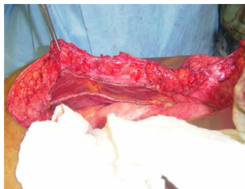
Figure 1: Posterior rectus sheath release used for retro rectus implantation of mesh and to obtain additional length in advancement of the rectus in conjunction with the external oblique release.

It is thought that such wound complications carried by CST are related to the division of rectus muscle perforator arteries that supply the overlying skin in the creation of the skin flap to find the