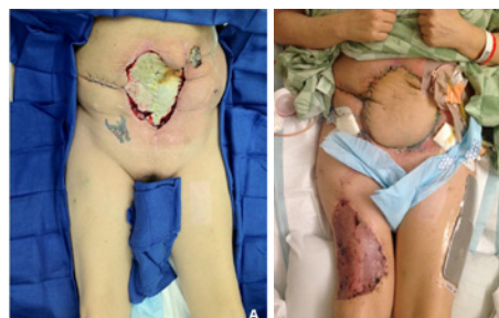
Figure 4: Anterolateral thigh flap used in patient for combined fascial and skin coverage in this patient with multiply recurrent ventral hernias after failed prosthetic, CST and biologic mesh.

More often than not larger ventral hernias cause the overabundance of or sagging overlying skin, stretch marks, scar and on extremes cases necrosis. Abdominal wall contouring procedures can be performed additionally at the time of the hernia repair, as the goal is to restore an aesthetic shape to the wall.